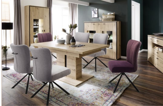
chair SANTIAGO with furniture program BUENOS AIRES